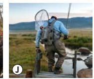
J Ranches Fishing Cabin