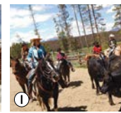
I Equestrian Center