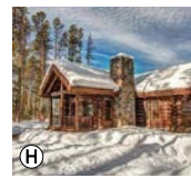
H Ranch Cabins