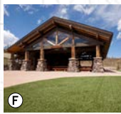
F Axel's Pavilion