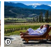
D Ranch Creek Spa