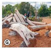
G Ranches Community Park