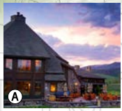
A Main Lodge