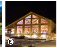
E High Lonesome Lodge