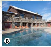
B Ranch House Restaurant & Activity Center